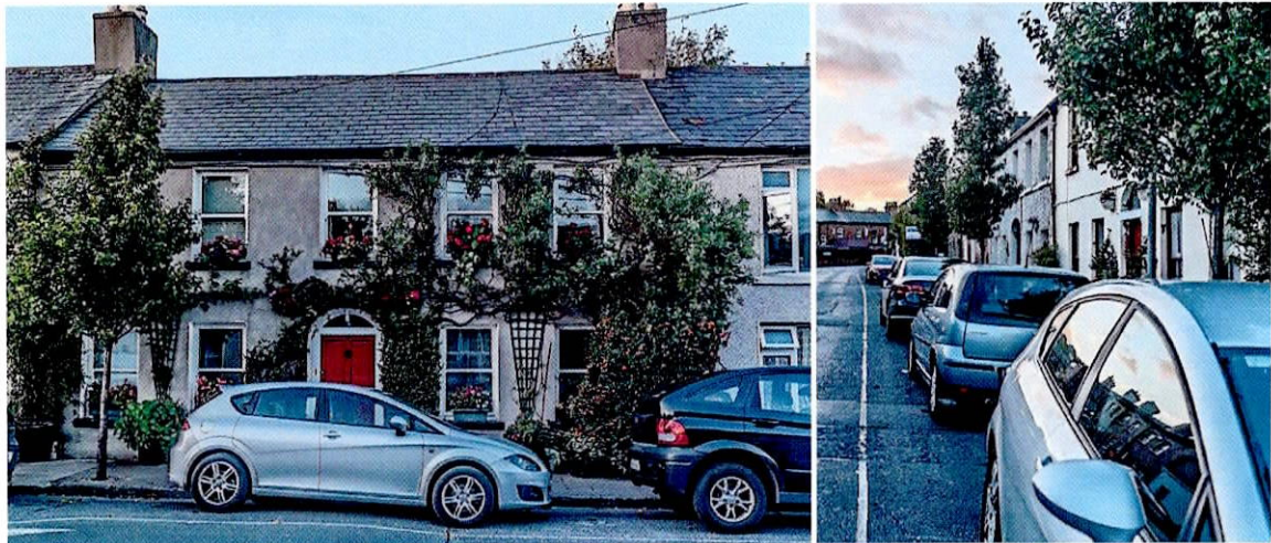
Images of community improvements & environmental efforts of upgrade, Monck Place

Bus Connects is a significant infrastructural project that has a clear logic to induce a more sustainable urban transport modal shift. I support the decarbonising of movement for the City's residents. In this observation I note that in tandem with the wider Bus Connects Objective, the protection and improvement of quality of local environments that are affected by the Bus Connects scheme is also paramount. Both objectives are mutually compatible and I support how the Bus Connects plan has managed these resolution of both as the relate to my local area.