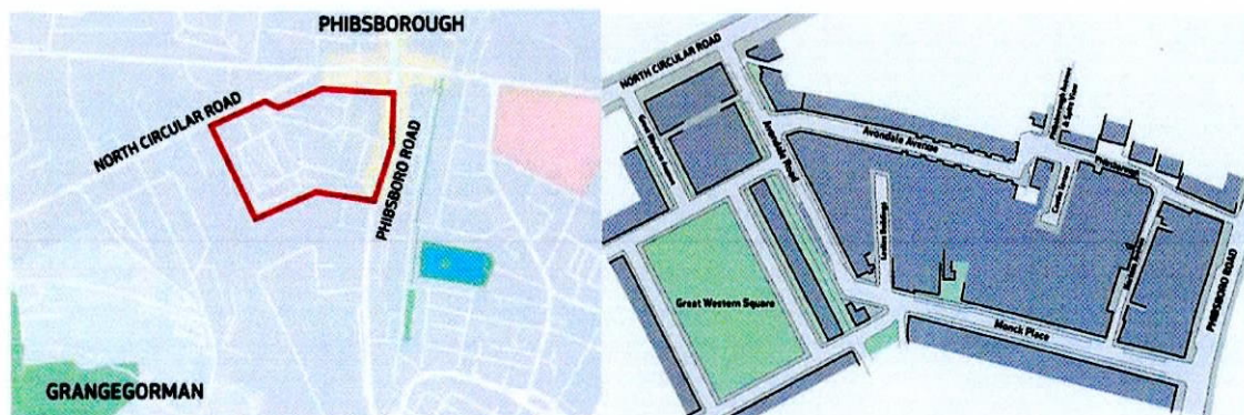
Red line Outline of environs of Monck Place, Avondale Road, Avondale Avenue, Leslie's Buildings and Great Western Square (left) and detail plan layout of streets (right)

The proposed alterations to vehicular traffic movement to the local network of streets in which I reside contained in the Bus Connects Blanchardstown to City Centre Core Bus Corridor Scheme reflect a resolution of my concerns.